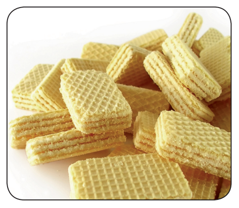
SKF wafer oven units can significantly reduce maintenance costs and improve line efficiency

By upgrading to the SKF unit, the manufacturer experienced higher production rates, and eliminated eight shutdown days per year related to maintenance on the carrier wheels and top roller positions.