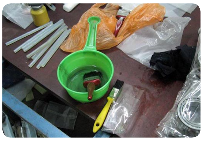
Typical tools used in a counterfeit workshop.

Instead of getting a premium quality product, you end up purchasing a poor quality product for a price much higher than it is worth.